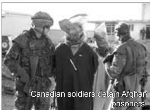
Canadian soldiers detain Afghan prisoners.

Conservative Party MP Gordon O'Connor: "[Gen. Hillier] speaks