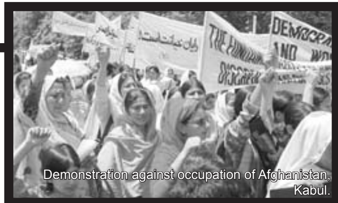
Demonstration against occupation of Afghanistan, Kabul.

Liberal Party leader and Prime Minister Paul Martin: "General