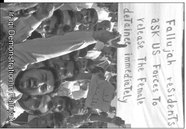
Iraqi Demonstration in Fallujah.

MARCH + RALLY MARCH 11th MARCH 12th MARCH 13th MARCH 14th MARCH 15th MARCH 16th MARCH 17th MARCH 18th MARCH 19th MARCH 20th MARCH 21st MARCH 22nd MARCH 23rd MARCH 24th MARCH 25th MARCH 26th MARCH 27th MARCH 28th MARCH 29th MARCH 30th MARCH 31st