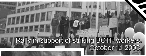
Rally in support of striking BCTF workers, October 11 2005.

meansthat working people in BC are moving into the centre-stage-position of the fight for social justice against the reactionary attacks of big business and imperialist government. The brave and unified move of BCTF members to stand up and fight against the BC Liberal government attacks, despite the strike being slandered as “illegal” by the government and the courts, has already set an