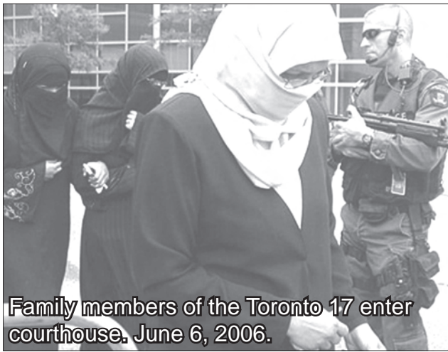
Family members of the Toronto 17 enter courthouse, June 6, 2006.

desires, and thoughts. In place of evidence of intent to carry out these “plots” the government has substituted further allegation of “terrorist camps” and circumstantial evidence of the “3 tons of ammonium nitrate,” allegedly sold and delivered to the 17 by a sting