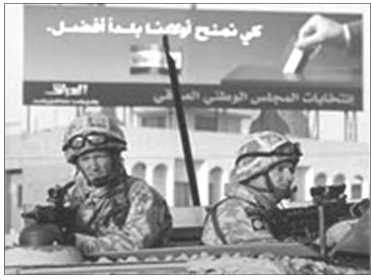
US troops in Baghdad, with elections billboard in the backgroun

limited participation The elections must not be seen so simply. The Iraqi people are not against elections, per say, they are against the occupation. For people in Iraq the elections represent colonial occupation and its local administrators and at the same time, the distant and desperate hope that something might change. The idea at the forefront of these hopes of change was that the election of an "Iraqi Government" could result in an end to the occupation. Unfortunately, although this proposal has been taken up by almost all parties both within and