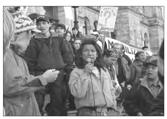
Anti-Poverty Committee Rally against throne speech, February 15th 2005.

As unemployment steadily increases and inflation rises, the attacks of the last four years will not lessen, but will instead become more and more severe. Internationally, the Canadian government is fighting these problems through the