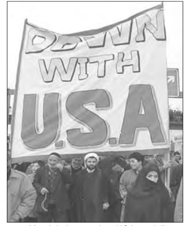
March in Iran against US imperialism, February 2001.

Currently the European Union (EU) is considering offering "economic rewards" to Iran if they abandon their nuclear program. One aspect that is "on the table" and being considered by both the US and EU is that of sanctions. The UN and US have been