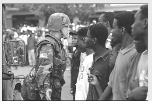
confronted by Haitian people at a demon stration calling for the return of Aristide.

situation in Haiti has deteriorated so severely under occupation that the police forces have sealed off poor neighbourhoods and are not even allowing ambulances in to treat people attacked by death squads. Canada's contribution to the