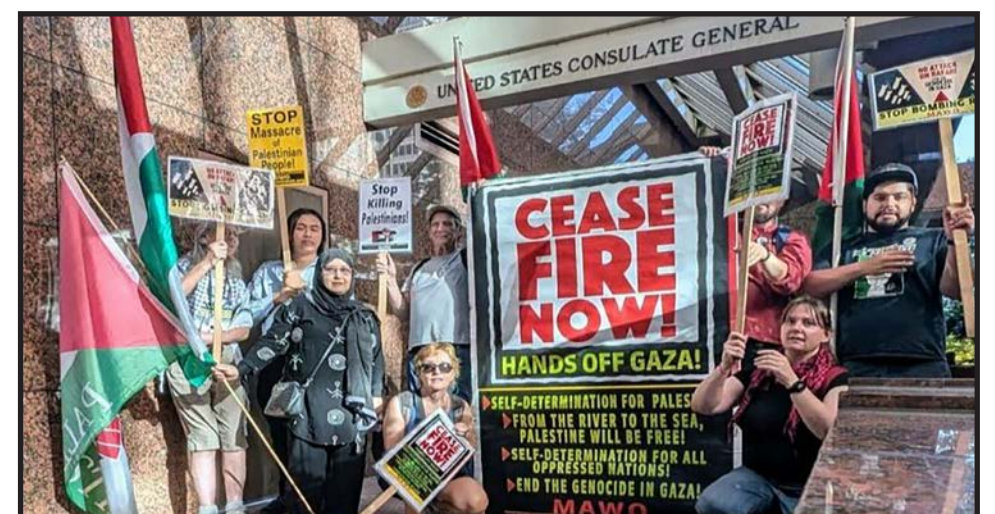
Weekly picket at the U.S. Consulate in Vancouver for Palestine on July 22, 2024