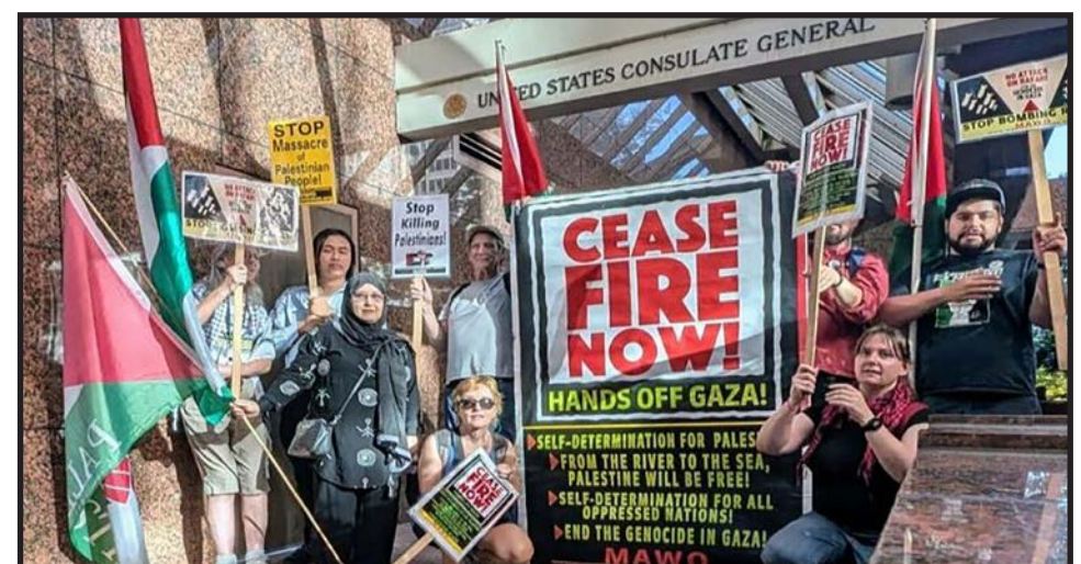
Weekly picket at the U.S. Consulate in Vancouver for Palestine on July 22, 2024