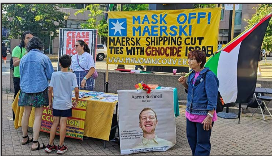
Info tabling for Palestine at the Vancouver Public Library on July 21, 2024.

Looking closer at the Israeli Zionist regime’s massacre in Nuseirat on June 8, one can see that Israel’s justification of rescuing Israeli captives was nothing more than an attempt to save face after over 8 months of failures. Despite the destruction of Gaza and a genocide against the Palestinian people, Israel has failed to achieve any military objectives, and instead face growing opposition within the Israeli ruling class and society. Israel has had repeated opportunities to negotiate with Hamas for a ceasefire to exchange Israeli captives with Palestinian political prisoners, who number over 10,000 held in Israeli jails. However, the Israeli regime chose a rescue operation that not only resulted in the massacre of over 275 Palestinian people but also killed 3 Israeli captives in the process. How can Israel claim any victory in this “rescue operation” of only 4 Israeli captives when it comes after 8 months of genocide, the killing over 43,000 Palestinians, and the killing of 3 more Israeli captives in Nuseirat in addition to other captives killed over the last 8 months