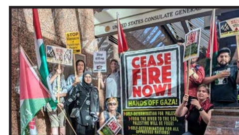
Weekly picket at the U.S. Consulate in Vancouver for Palestine on July 22, 2024

For over 100 years, both while under British colonial rule and since 1948 under Israeli occupation, Palestinians have tried every avenue to assert their right to self-determination, including legal and diplomatic measures. 78 resolutions in the United Nations demanding that Israel respect various aspects of