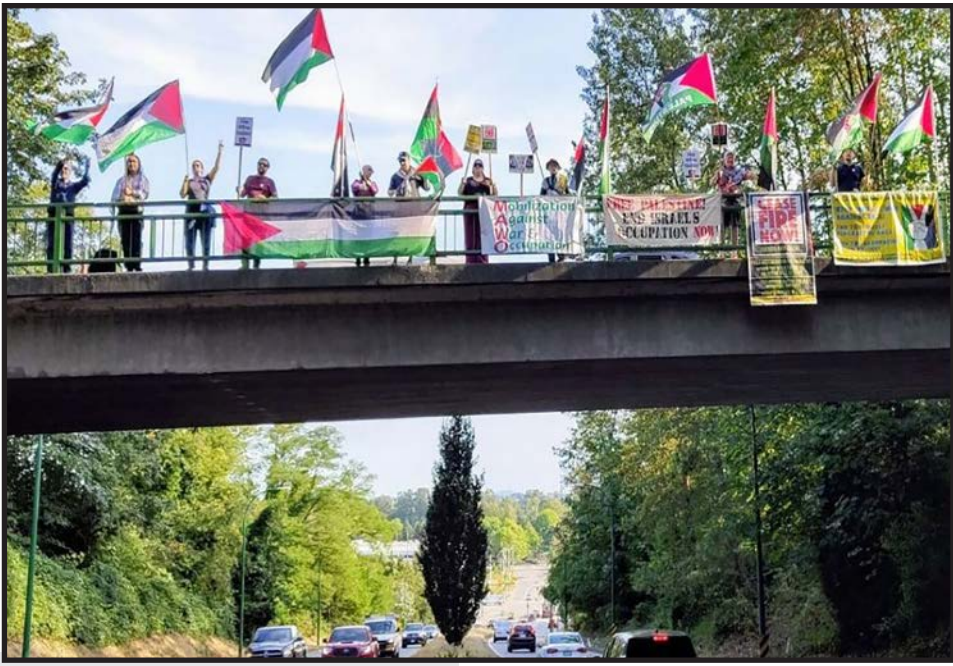
Banner drop for Palestine at Marine Drive & Boundary in Vancouver, July 26, 2024

regime has issued evacuation orders for 86% of Gaza, and humanitarian so-called “safe zones” are regularly bombed by Israeli Zionist forces. 90% of Gaza’s 2.1 million population — nine out of 10 people — are internally displaced, many up to 10 times.