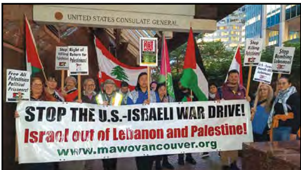
Bi-weekly picket at the U.S. Consulate in Vancouver for Palestine & Lebanon on October 7, 2024